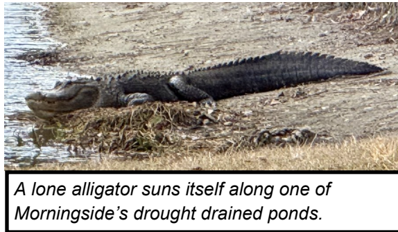
A lone alligator suns itself along one of Morningside's drought drained ponds.

So, this seems to be a good time to remind everyone that we do in fact share this land with the alligators, and quite a lot of other wildlife. If you see an alligator out where you usually don't, be aware that although they were removed from the endangered species list in 1987, there are still numerous regulations in place to protect alligators. Alligators, despite being considered an apex predator, do not naturally attack people. They don't associate people with food, and they don't consider humans to be potential food. However, alligators can learn, and quickly. If an alligator is fed by people, that alligator will associate people with food. It will then be far more likely to approach people, potentially attacking them – especially smaller people, like children. Florida Statute 372.667 even makes it a misdemeanor criminal offense